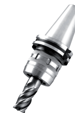
High Clamping Power Chucks