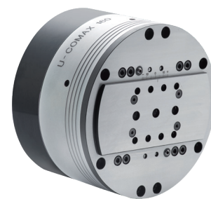
Axial drive NC heads for transfer machines and special units