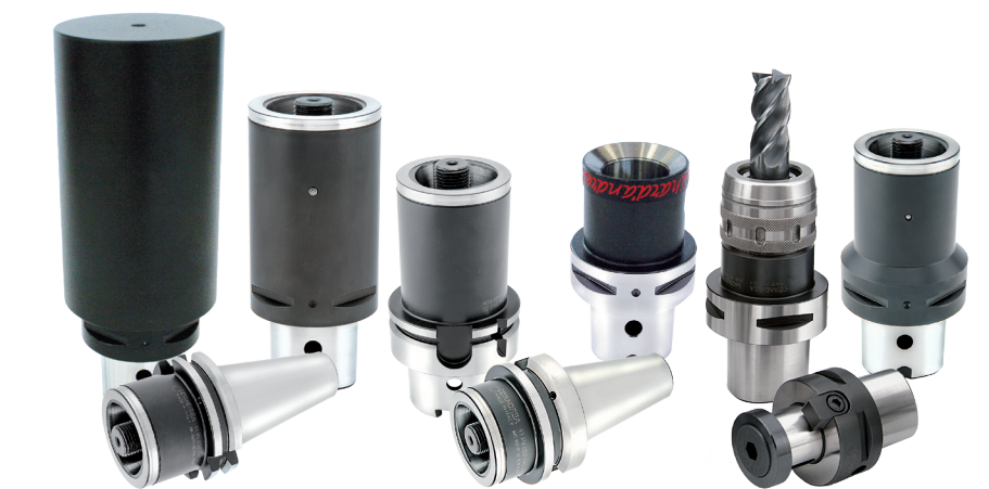
Modular Toolholders PSC