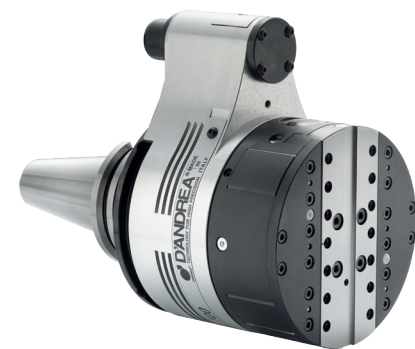
NC Heads for machining centers