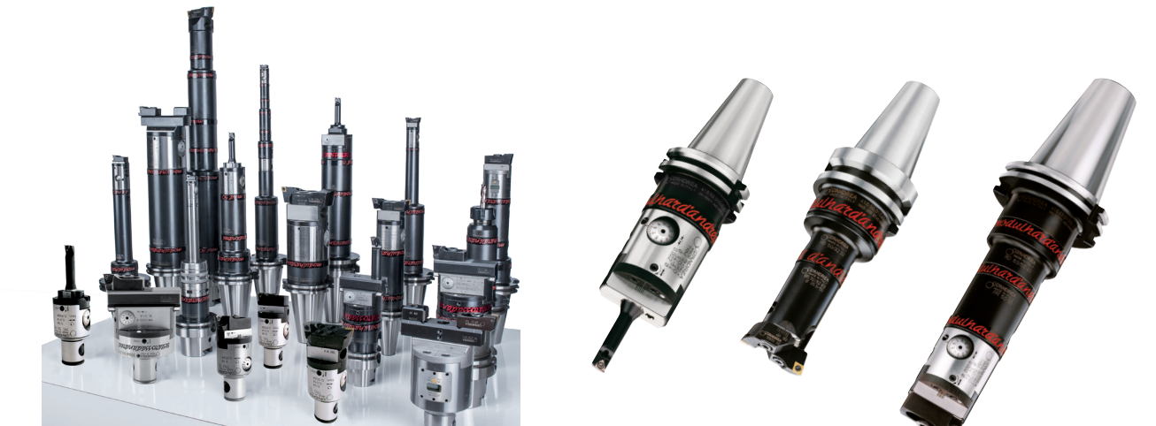
Modular Toolholders MHD'