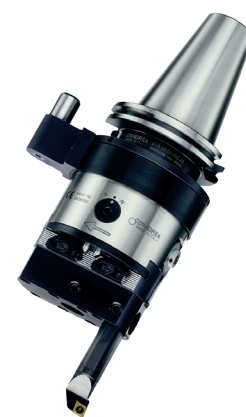
Automatic Heads for machining centers and milling machines