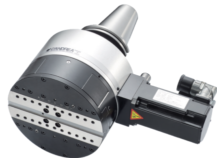
NC Heads for milling machines